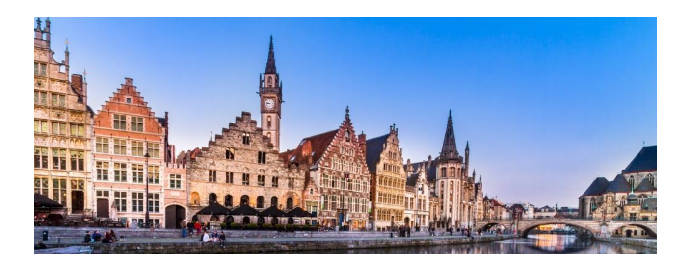
More information: https://visit.gent.be/nl/gent https://uitin.gent.be/

Enjoy your stay in the beautiful historic city of Ghent.